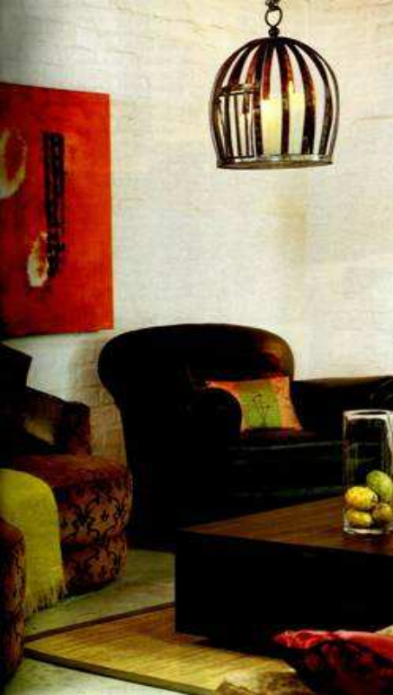
Tuis – September 2004