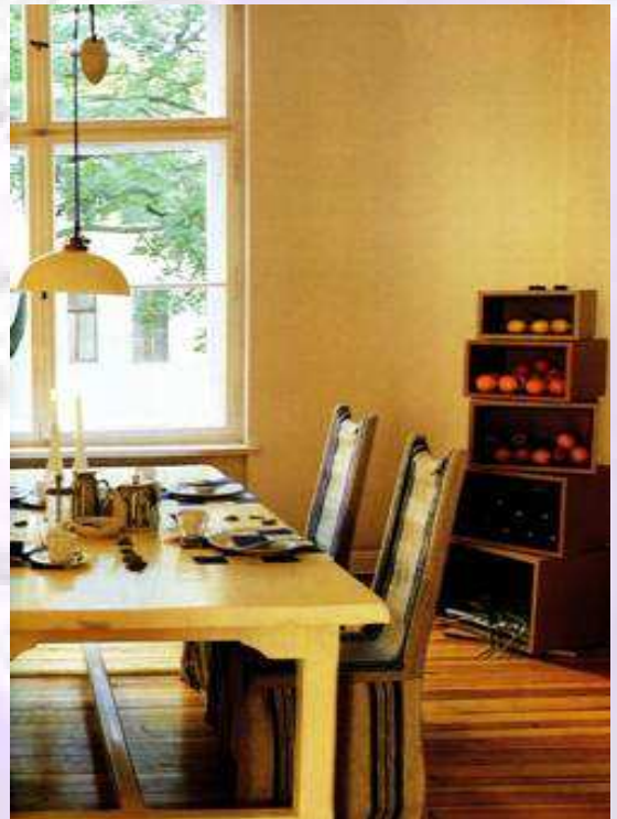
Elle Decoration – May/June '99

Use old wooden crates and stack them higgledy-piggledy (disorderly) to display fruit, wine or napkins.