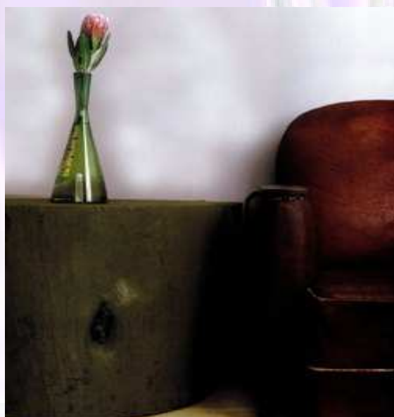
Real Simple SA – June 2006