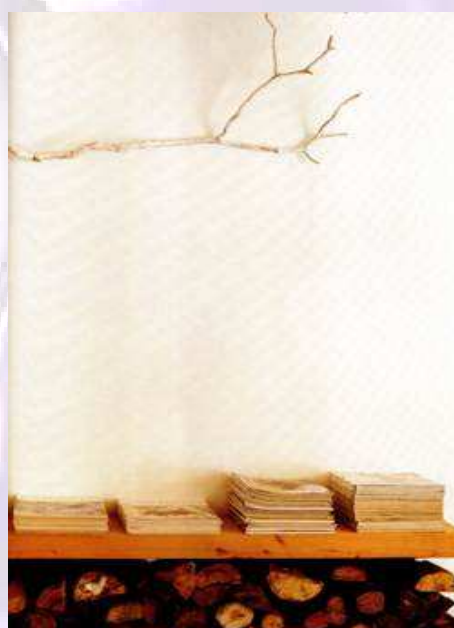
Elle Decoration – Winter 2006

Bring the outside to the inside – balance a wooden shelf for magazines on top of stacked firewood and decorate the wall with a white-painted branch.