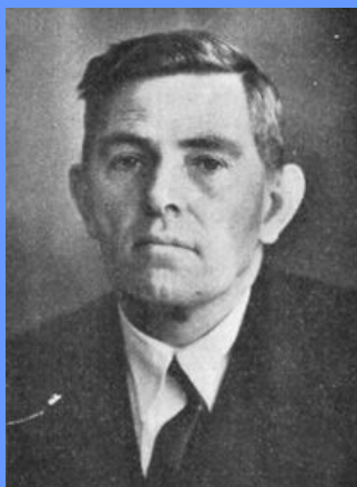
C. LOUIS LEIPOLDT, December 1946 LEIPOLDT'S CAPE COOKERY

'My interest in cookery dates from the time when, as a little boy in the late eighties of the last century, I assisted, in a very minor and suppressed capacity, at the culinary operations of a very expert Coloured woman cook who bore the reputation of being one of the best in the Cape Colony.'