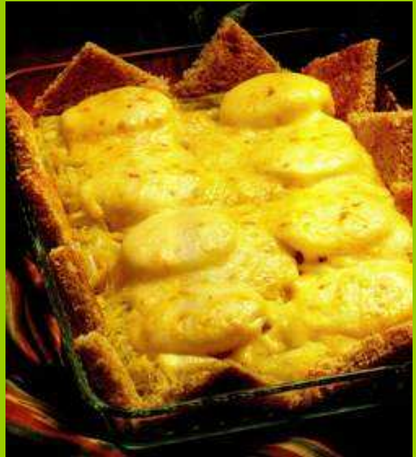
Gewilde Groentegeregte – Annette Human

250 ml milk 25 ml Maizena 5 ml mustard powder 2 ml salt Bit of pepper 250 ml grated mature Cheddar cheese 2 slices toast