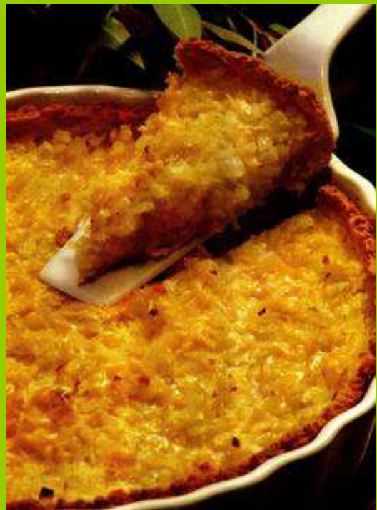
Gewilde Groentegeregte – Annette Human

8 medium onions 30 ml butter/margarine Salt and pepper to taste 125 ml cream or ideal milk 1 egg Grated Cheddar cheese