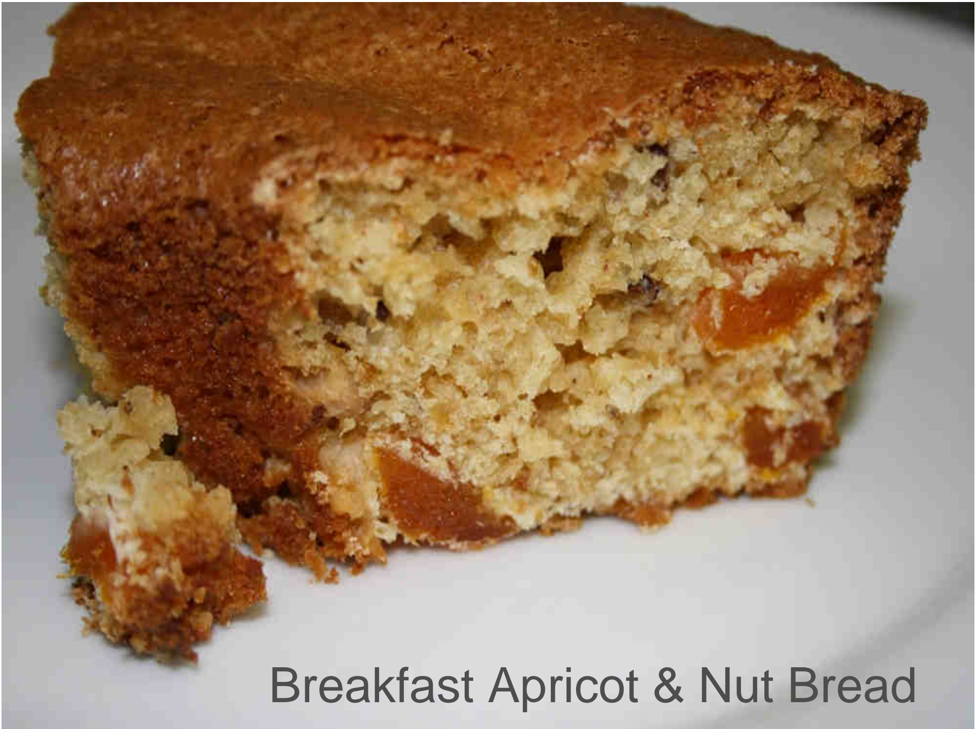
Breakfast Apricot & Nut Bread