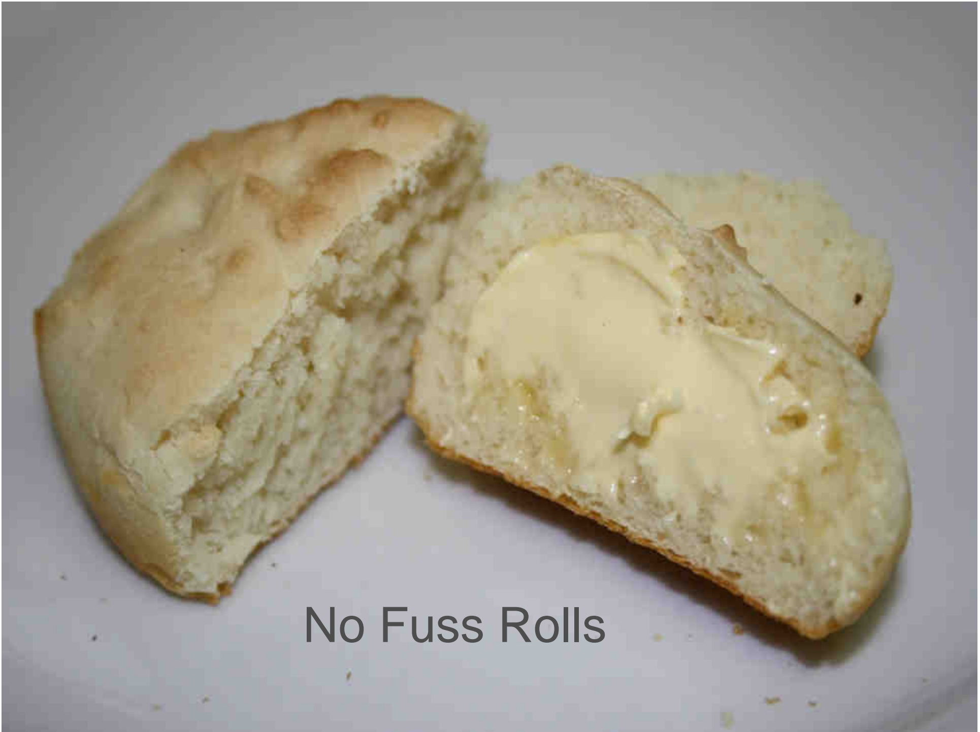
No Fuss Rolls