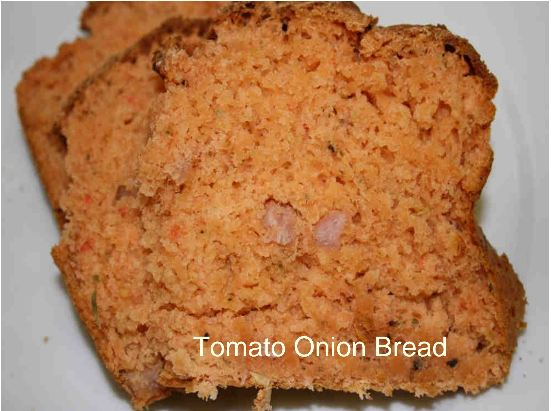
Tomato Onion Bread