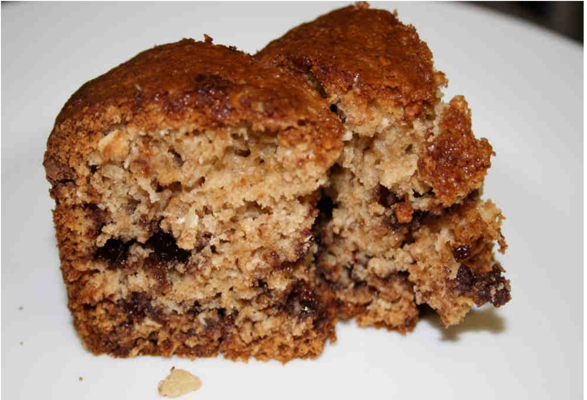
Choc Chip, Almond & Coconut Bread