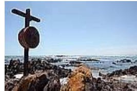
View from restaurant.