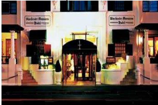
Hotel from the front

For coffee, they took us to the Winchester Hotel – also in Sea Point but right next to the sea. (Well, there’s a road in-between). Wow! Old-world charm, richly decorated with oranges and reds and the courtyard – they have Sunday brunches there with a live jazz band. Service with a smile and you hear all the foreign accents around you.